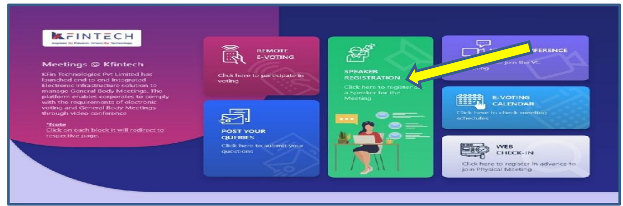
Select UCO BANK EGM & Furnish details

Register as speaker from 10.00 A M on 4<sup>th</sup> May, 2021 to 5.00 P M on 5<sup>th</sup> May, 2021.