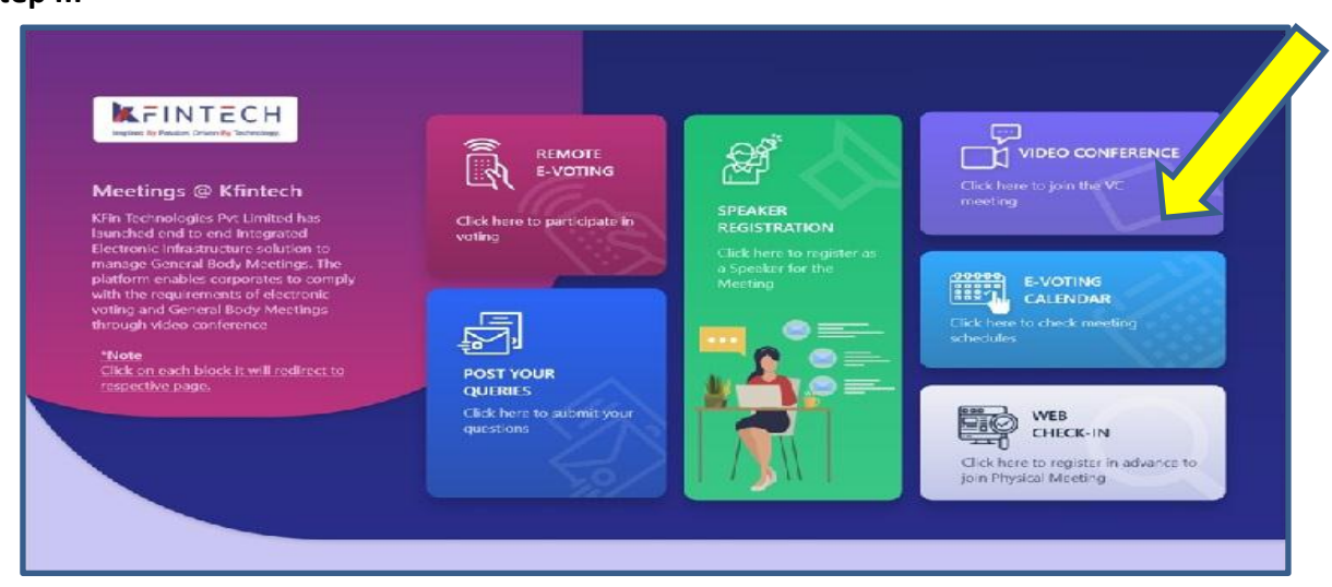
Step III -

(User ID is DPID-CLIENT ID/Folio no.) (Password: Sent by e-mail to all shareholders on 12<sup>th</sup> April, 2020 along with downloadable link for notice of EGM). (For password issues contact Toll free number 1800 345 4001)